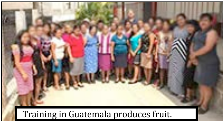
Training in Guatemala produces fruit.

Earlier this year we had a workshop in Guatemala. The national STS instructors in the region are growing and one instructor, a former missionary to Guatemala, reported being "really blessed and affirmed" by the ongoing impact of STS. This instructor observed that at a church, where