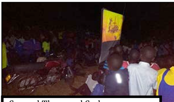
Several Thousand Sudanese Refugees Watching God’s Story

We are excited also about the distribution of God’s Story in various languages of Thailand. Conservatively, we believe 30,000-40,000 copies of Thai languages have been shared!